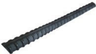
ISFP - HRTR

Material : Mild Steel Size : 25 / 30 / 50 / 70 mm Weight : 0.105 / 0.126 kg. 0.210 / 0.294 kg.