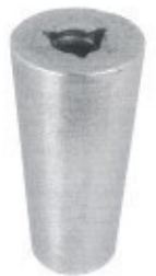
ISFP - SC

Material : St37 Size : 120x120x6/10mm Weight : 0.660 / 1.10 KG