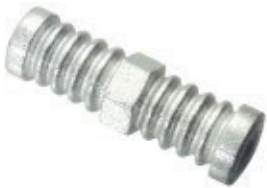
ISFP - WB

Material : HR Sheet Size : Ø 4 - 10mm Weight : 0.460 kg