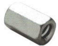
ISFP - HN

Material : Mild Steel Size : 100 / 105 mm Weight : 0.450 / 0.472 kg.