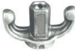
ISFP - WNF

Material : Malleable Cast Iron / SG Iron Weight : 0.320 kg. Working Load : 90 KN