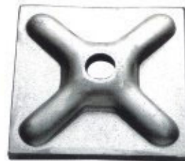
ISFP - WP

Material : EN - 8 / MS Size : Ø 15mm, upto 6mtr. Length Ultimate Load: 140 / 120 KN Weight : 1.47 KG/Mtr.