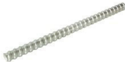
ISFP - CRTR

Size : Ø 15mm, upto 6mtr. Length Ultimate Load: 190 KN Weight : 1.47 KG/Mtr.