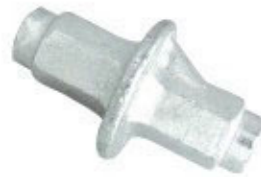
ISFP - WBD

Material : Malleable Cast Iron / SG Iron Size : 120mm Length Weight : 0.500 KG