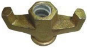
ISFP - WNC