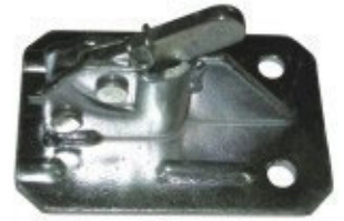
ISFP - SC

Material : High Quality Steel (Casted Body & Forged Wedge) Size : Ø 4 - 10mm / Ø 7 - 12mm Weight : 0.380 Kg / 0.490 Kg