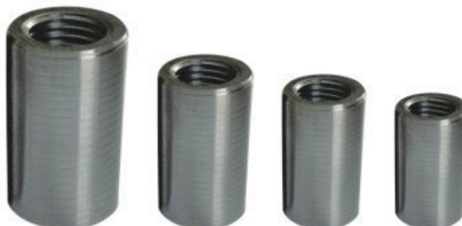
BAR COUPLER ISFP - BCP

Material : EN8 Weight : 3.2 kg. ISFP - BC