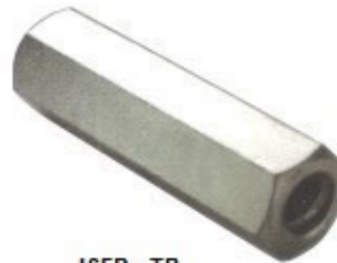
ISFP - TB

Material : Malleable Cast Iron / SG Iron Size : 116mm Length Weight : 0.540 KG