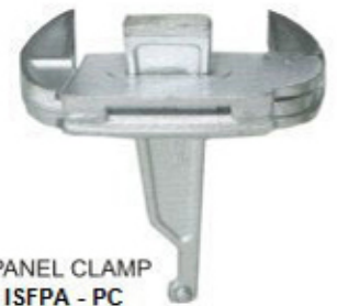
PANEL CLAMP ISFPA - PC