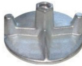
FORGED ANCHOR NUT ISFPA - FAN