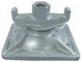
COMBINATION PLATE SQUARE ISFPA-CPS