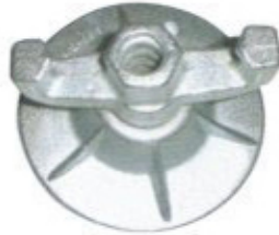
COMBINATION PLATE ROUND ISFPA-CPR