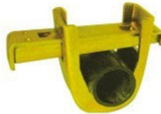
ISPC - SIWC SINGLE WEDGE COUPLER FOR TUBE OD 42.3mm / 48.3mm