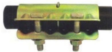
ISPC - SLC SLEEVE COUPLER FOR TUBE OD 48.3mm (EN-74 / BS-1139)