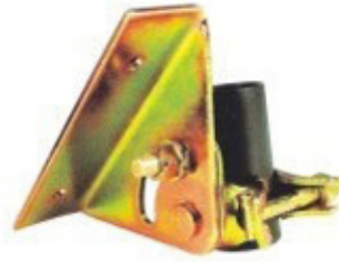
ISPC - SCC STAIRCASE COUPLER FOR TUBE OD 48.3mm (BS-1139)