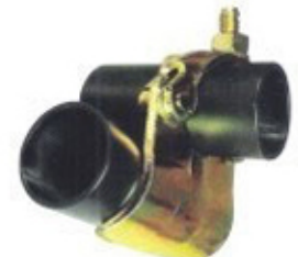
ISPC - PPC PRESSED PUTLOG COUPLER FOR TUBE OD 48.3mm (EN-74 / BS-1139)