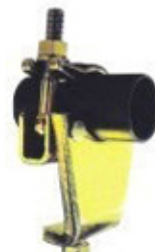
ISPC - GC GRIDER COUPLER FOR TUBE OD 48.3mm (AS - 1576.2)