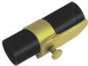
ISPC - PHA PUTLOG HEAD ADAPTER FOR TUBE OD 48.3mm (EN-74 / BS-1139)