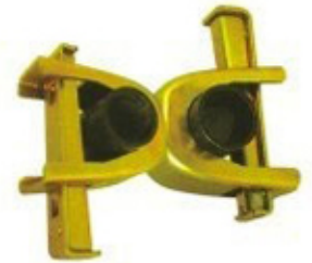
ISPC - SWC SWIVEL WEDGE COUPLER FOR TUBE OD 42.3mm / 48.3mm