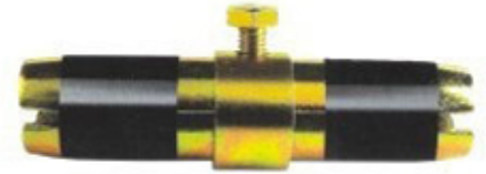
ISPC - JP JOINT PIN FOR TUBE OD 48.3mm (EN-74/BS-1139)