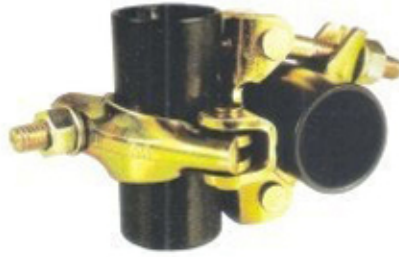
ISPC - PDC PRESSED DOUBLE COUPLER FOR TUBE OD 48.3mm (EN-74/BS-1139)