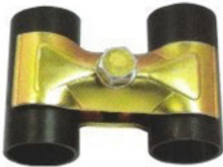
ISPC - FC FENCING COUPLER FOR TUBE OD 42.3mm / 48.3mm (BS-1139)