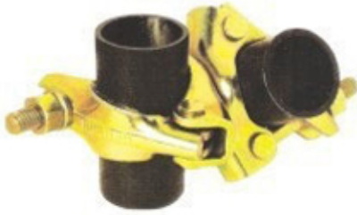
ISPC - PSC PRESSED SWIVEL COUPLER FOR TUBE OD 48.3mm (EN-74/BS-1139)