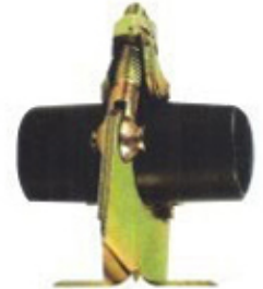
ISPC-TBB TOE BOARD BRACKET FOR TUBE OD 48.3mm (BS-1139)