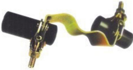
ISPC - SC SUPPORT CLAMP FOR TUBE OD 48.3mm (BS-1139)