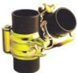
ISPC - JSC JAPANESE SWIVEL COUPLER FOR TUBE OD 48.3MM & 42.3MM (JIS : G3444 / SS-311)