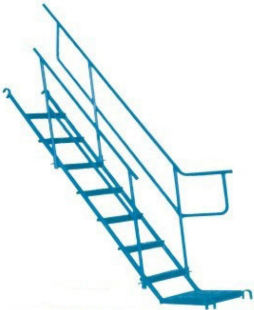
STAIRCASE UNIT WITH HANDRAIL