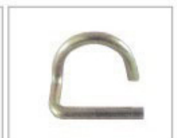
Gravity Pin-B ISSA-GPB