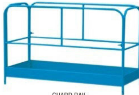
GUARD RAIL (ISSA - GR)