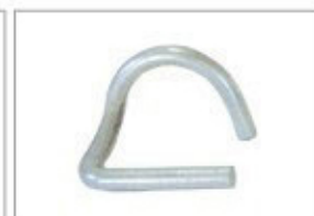
Gravity Pin - A ISSA-GPA