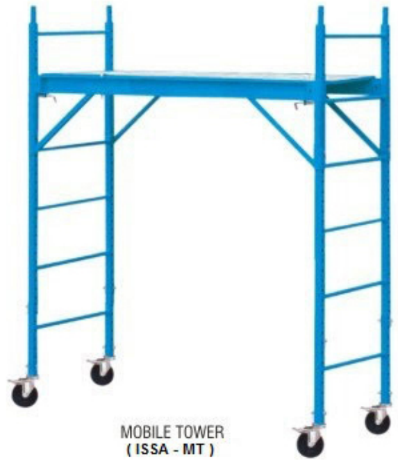
MOBILE TOWER (ISSA - MT)