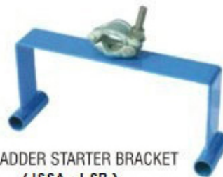
LADDER STARTER BRACKET (ISSA - LSB)