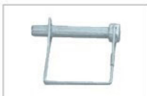
Snap Pin ISSA-SP