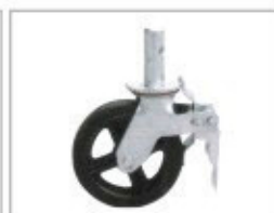
Caster Wheel ISSA-CW