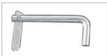
Toggle Pin ISSA-TP