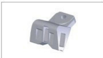
Brace End ISRLA-EB