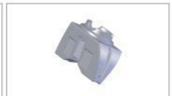
Ledger End ISRLA-LE