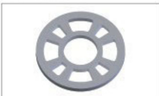
Frame Ring/Rosette Ring ISRLA-FR