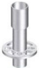
BASE COLLAR ISRL-BC