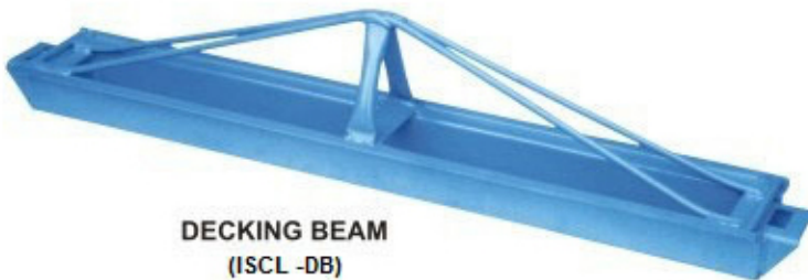
DECKING BEAM (ISCL -DB)