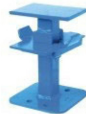
DROP HEAD (ISCL -DH)